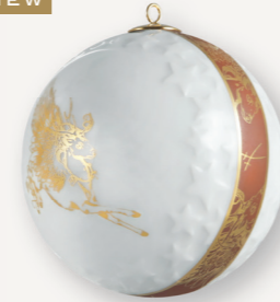
Ball, Embossed Stars MEISSEN Christmas Peryton Ø 7 cm 79B372-55M39