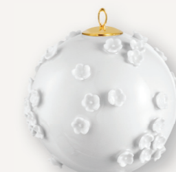
Ball, Snowball Blossoms Ø 5 cm 000001-55M21