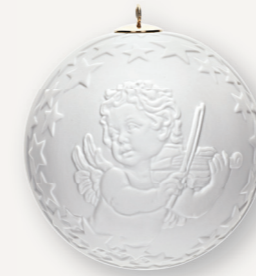
Ball With Relief Motiv, Musician Angel Ø 7 cm 001001-55M24