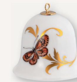
Miniature Bell, Butterfly H 5 cm 696101-55M02