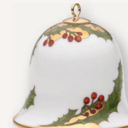
Miniature Bell, Holly H 5 cm 700210-55M02