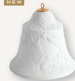
Bell With Relief Motiv, Foxes H 7,5 cm 001001-55N00