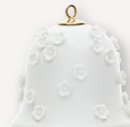
Bell, Snowball Blossoms H 5,5 cm 000001-55M54