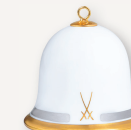
Miniature Bell, Trademark MEISSEN H 5 cm 989590-55M02