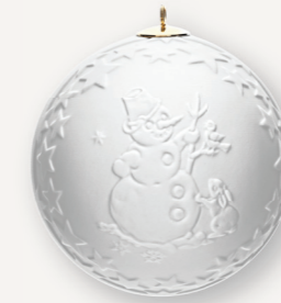
Ball With Relief Motiv, Snowman Ø 7 cm 001001-55M36