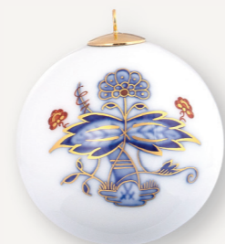
Ball, Noble Blue Ø 5 cm 803090-55M09