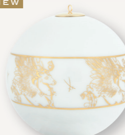
Ball, Embossed Stars MEISSEN Christmas Peryton Ø 9 cm 79B372-55M91