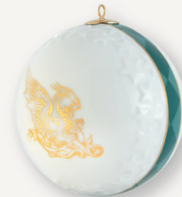
Ball, Embossed Stars Winged Lioness Ø 7 cm 79A888-55M39