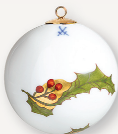
Ball, Holly Ø 5 cm 700201-55M09