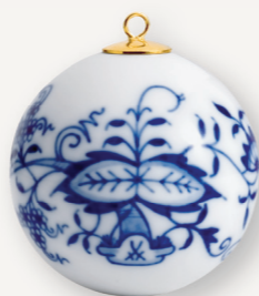
Ball, Blue Onion Ø 5 cm 800101-55M09