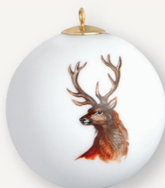
Ball, Deer Head Ø 5 cm 26A108-55M09