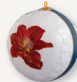
Ball, Embossed Stars Amaryllis Ø 7 cm 79A849-55M39