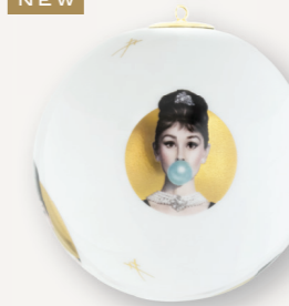
Ball, Audrey Ø 9 cm 79A994-55M91