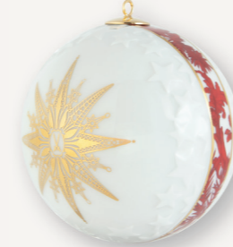
Ball, Embossed Stars MEISSEN Christmas Star, red Ø 7 cm 79A941-55M39