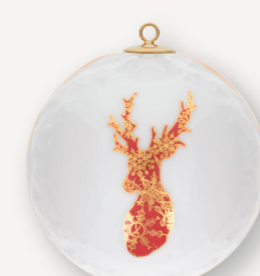
Ball, Embossed Stars Deer Ø 7 cm 79a732-55m39