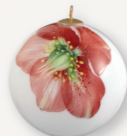
Ball, Giant Bloom Ø 5 cm 61A167-55M09