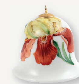
Miniature Bell, Iris H 5 cm 03A104-55M02