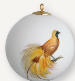
Ball, Paradise Bird Ø 5 cm 26A109-55M09