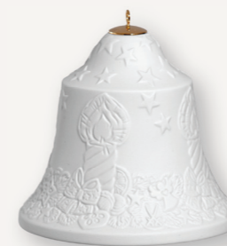
Bell With Relief Motiv, Advent Wreath H 8 cm 001001-55M72