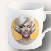
MUG MARILYN, GOLD V 0,25 L 79a993-55810