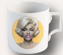
BIG MUG MARILYN, GOLD V 0,5 L 79a993-55326