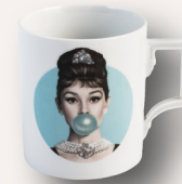
MUG AUDREY, BLUE V 0,25 L 79a992-55810