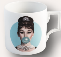
BIG MUG AUDREY, BLUE V 0,5 L 79a992-55326