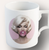
MUG MARILYN, PINK V 0,25 L 79a991-55810