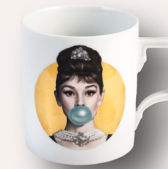
MUG AUDREY, GOLD V 0,25 L 79a994-55810