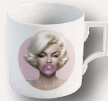
BIG MUG MARILYN, PINK V 0,5 L 79a991-55326