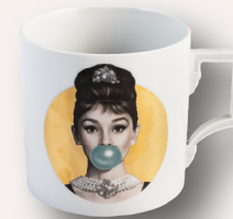
BIG MUG AUDREY, GOLD V 0,5 L 79a994-55326